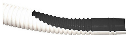
Tube section with double coating