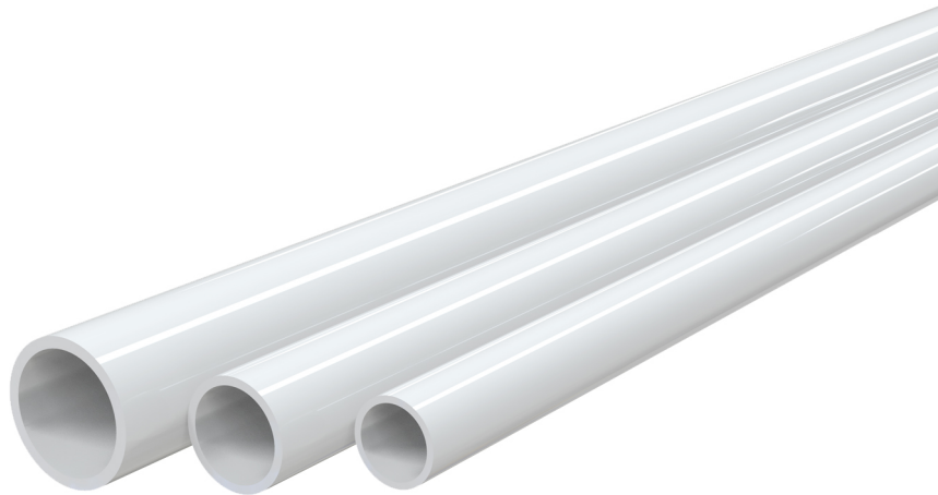
TCR-32 TCR-25 TCR-21

- cod. 11126324 - cod. SCD300034 - cod. SCD300016