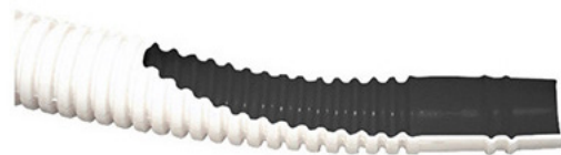
Tube section with double coating